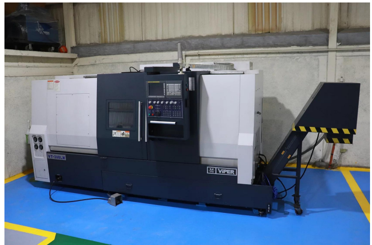
Vertical turning center CNC VIPER VT-28BL