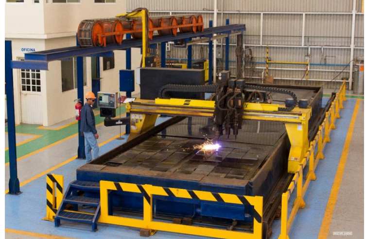
Plasma CNC ESAB Avenger X P2 4000