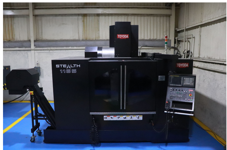
Vertical machining center CNC TOYODA WELLE AA1165G