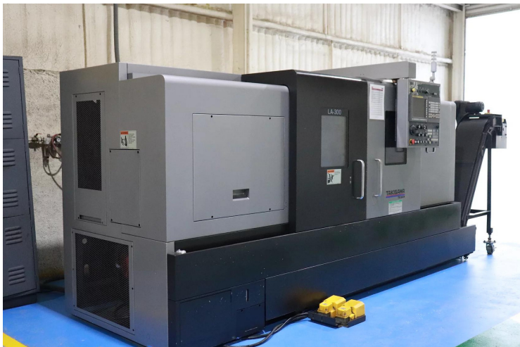
Vertical turning center CNC TAKISAWA LA-300-2