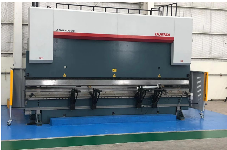
Press brake CNC DURMA AD-S60600