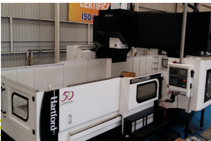
Gantry Machining center CNC HARTFORD PRO-3210SG