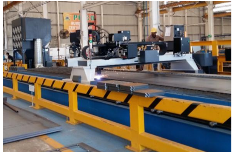
Plasma CNC HYPER THERM Pro-Arc