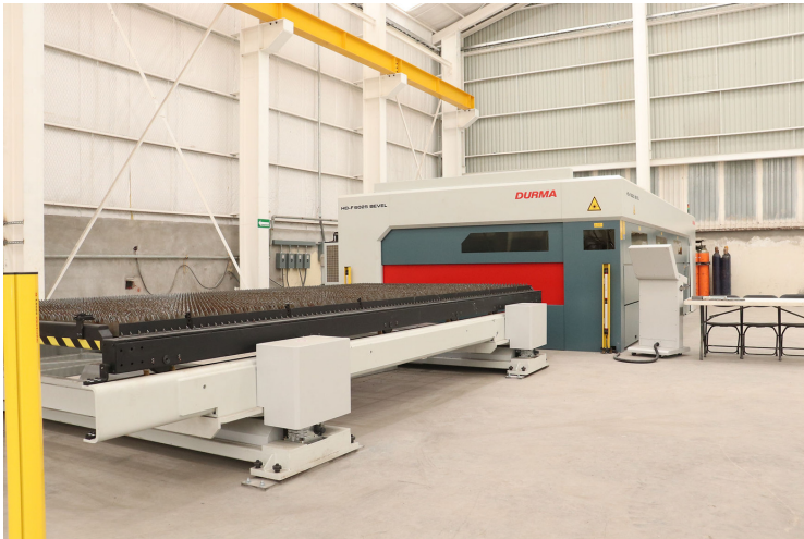
Laser CNC DURMA HD-F 6025 de 8 KW