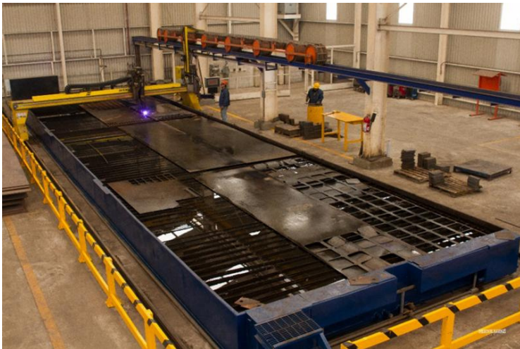
Plasma CNC ESAB Avenger 6500