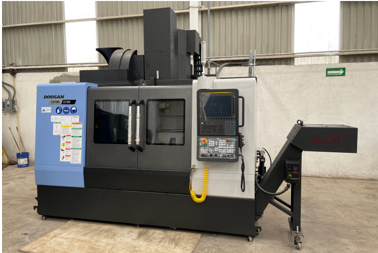
Vertical machining center CNC DOOSAN DNM 5700