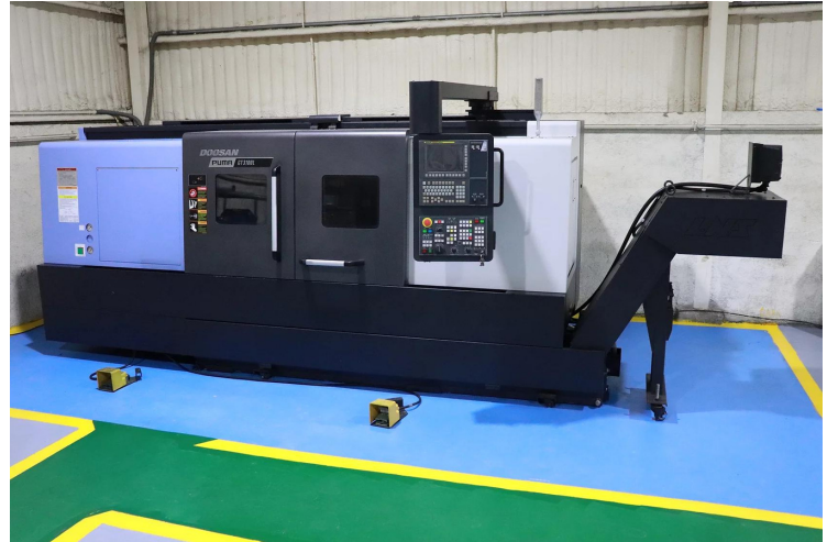
Centro de torneado vertical CNC DOOSAN PUMA GT3100L